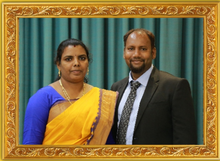
Chairman & Managing Director Message

Sri Gokulnatha Mission Educational Institutions, Namakkal is a Premier name in the field of Paramedical, Hotel Management, Technical education, Teacher Training and Yoga Education. Established in 2003. We have been catering various courses of the paramedical sciences with an excellent track record as well as for courses of Hospitality Sector & Technical Education. With various awards at state government levels in the spheres of the job training, paramedical, Hospitality education & Technical Education we have become a formidable institution with an unmatched reputation. Our degrees are well accepted worldwide enabling our graduates to be placed in reputed institutions both inside and outside the country. It has been designed to play a key role to produce performance oriented professionals who will excel in their respective fields with excellence and shape the destiny of Health Care industry, Hospitality Sector & Technical Education. Our vision is to play a leading role in shaping quality of students and to Spread-over knowledge through the expertise of modern education.